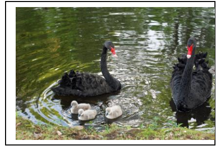
Spring on the Lake

Oak Hills Lake Development Association (225) 315-1173