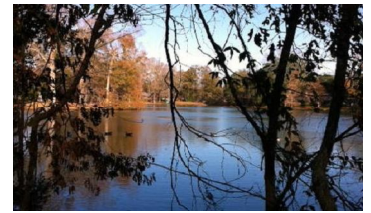
Winter on the Lake

Oak Hills Lake Development Association (225) 769-5744 www.oakhillslakebr.com