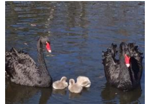
Romeo & Juliet in Jan. 2015

Oak Hills Lake Development Association www.oakhillslakebr.com