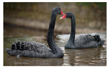
Photo of Black Swans on Oak Hills Lake